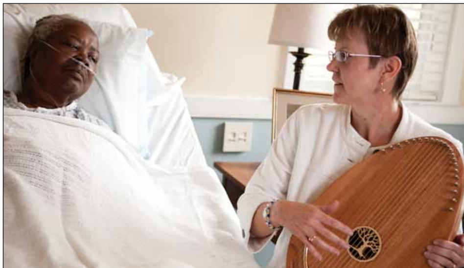
A Montgomery Hospice volunteer provides soothing music to a patient as she plays the Reverie Harp at the bedside. The Healthcare Initiative Foundation also provided grant funds to purchase two additional harps for the program.

Thanks to a generous grant from the Healthcare Initiative Foundation (HIF) to launch an end-of-life dementia program, Montgomery Hospice has been able to expand its services through the development of a Complementary Therapies program. see page 4 - Therapies