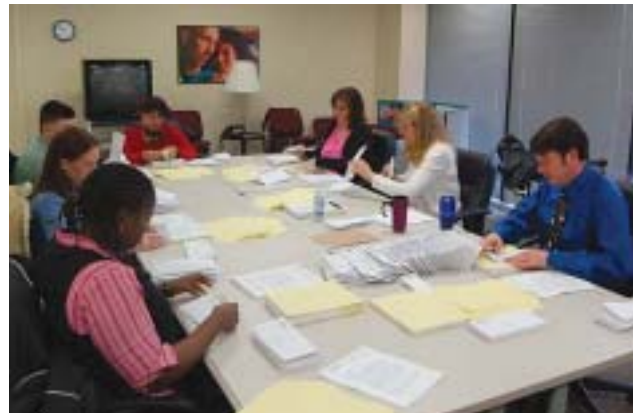
Once a month for five years, volunteers from the Register of Wills have helped Montgomery Hospice mail thousands of notices about grief and grief counseling to bereaved people. The volunteers’ work helps reduce suffering in the community.

ROW staff know from their hospice training that people grieve at their own pace. That means some visitors will not be ready to complete all the needed paperwork on a particular visit. When that happens, ROW staff set aside the documents and listen sympathetically as visitors describe what their loved ones meant to them.